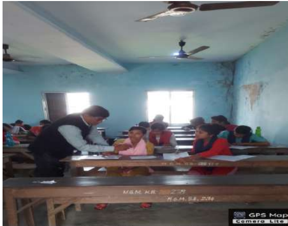
2P2H+8CJ, Bhupati Nagar, West Bengal 721425, India

Latitude 22.00099683° Longitude 87.72859721° Local 10:37:26 AM Altitude 7.88 meters GMT 05:07:26 AM Tuesday, 21.02.2023