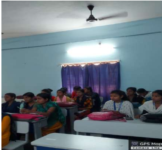
2P2J+M77, Bhupati Nagar, West Bengal 721425, India

Latitude 22.00006082° Longitude 87.72905349° Local 12:45:17 PM Altitude 7.88 meters GMT 07:15:17 AM Wednesday, 15.02.2023