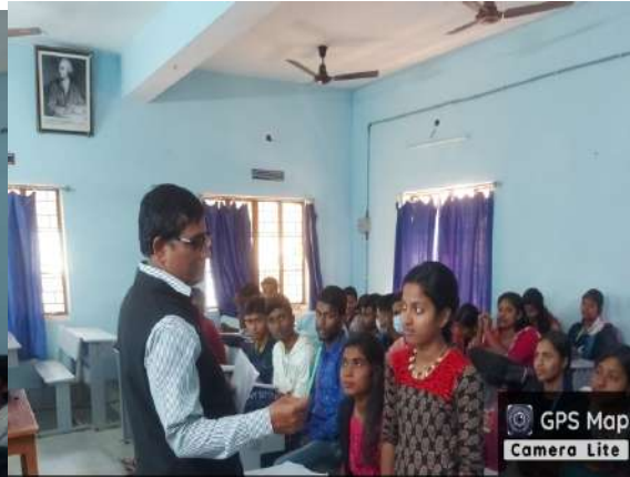
2P2H+5CR, Mugberia Hospital Rd, Bhupati Nagar, West Bengal 721425, India

Latitude 22.0023955° Longitude 87.7306517° Local 11:21:33 AM Altitude 7.88 meters GMT 05:51:33 AM Saturday, 11.02.2023