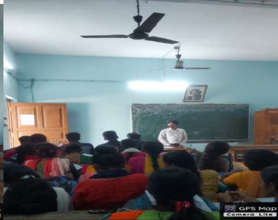
Mugberia Gangadhar Mahavidyalaya, 2P2H+3H2, Bhupati Nagar, West Bengal 721425, India

Latitude 22.00099683° Longitude 87.72859721° Local 10:37:26 AM Altitude 7.88 meters GMT 05:07:26 AM Tuesday, 21.02.2023